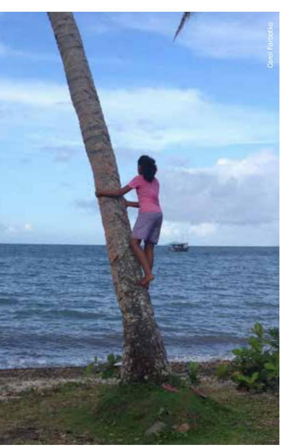
From the village of Natalai, Fiji, April 2017; the village suffered extensive damage during Cyclone Winston in February 2016.

an existential threat to their culture, identity and connections to land and sea, a risk to their self-determination and indigenous rights, and some individuals cannot countenance life without a homeland to live in or return to. A range of indigenous leaders, elders and activists across the Pacific Islands are clearly articulating their carefully considered intention to remain on climate-impacted indigenous territories for cultural, spiritual and political reasons. The most important issue, according to those voluntarily resisting mobility, is not 'where will we go?' or 'how will we survive?'; it is 'how do we maintain our identity and build pathways to a self-determined, resilient future?'. Voluntary immobility is an important