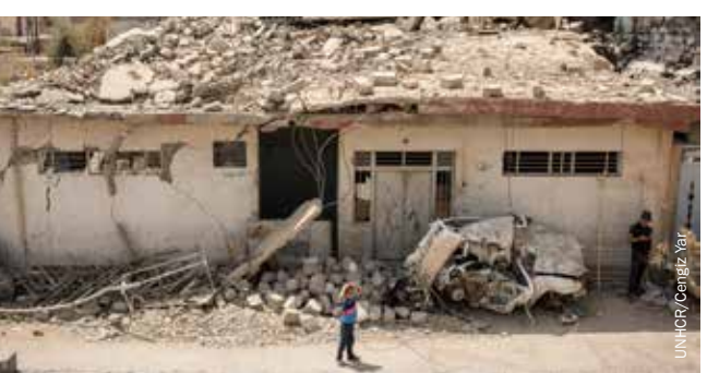
Badly damaged houses in the Al-Resala neighbourhood of west Mosul, Iraq.

coupled with the uncertainty of the process in general, opens the door to further conflict. Additionally, if there are no steps in place to ensure arbitration and appropriate restitution or compensation, a returns process may exacerbate competing claims over land rights.