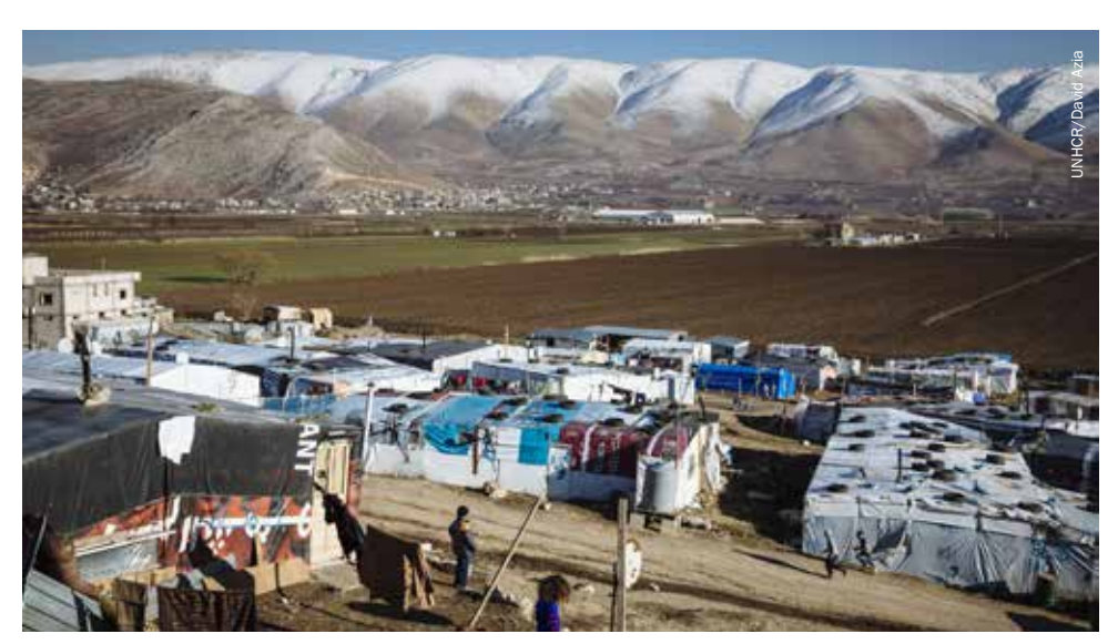
An informal settlement hosting 120 families near Barelias, Beka'a Valley, Lebanon.

once conditions allow it – thereby assuaging widespread fears that the international community is aiming for local integration. An increasing percentage of UNHCR's meagre resources goes to assisting vulnerable Lebanese, either through small community projects such as provision of refuse trucks and solid waste management plants, or through delivery of household assistance to poor Lebanese families including fuel cards and rehabilitation of housing. Municipal coordination bodies are in place in three key municipalities (Arsal, al Qaa and Zahle).