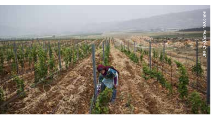
Workers, who are mostly Syrian refugee children and teenagers, work in the vineyards in the Beka' a valley, Lebanon, from 7am until 1pm; many also work a second shift in the afternoon. One 13-year-old girl, the youngest of seven children in her family, said: "I haven't been to school for two months. It is high season for work and I have to work double shifts. We need the money to survive."

affected households back to the point where they would be able to rebuild and maintain both bonding and bridging social capital.