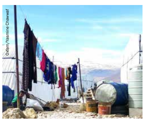
Beka'a Valley, Lebanon.

who live in tents) pay rent, at an average cost of US$189 per month. Eviction is a major fear due in large part to difficulties in affording rent. Health care is also a major expense and concern, as health insurance provided through UNHCR covers only 75% of costs (and then only for life-saving procedures and obstetrics). Cash-based humanitarian assistance meant to alleviate these financial burdens is neither sufficient nor provided to all refugee households. Over 70% cent of Syrian refugees in Lebanon live in poverty and households have on average debts totalling $857.