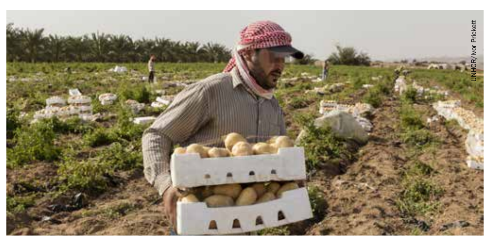
This Syrian refugee now works for a Jordanian farmer, having obtained (with help from his employer) a work permit from the government.

with formalisation, such as paying fees that are legally supposed to be borne by employers. Furthermore, other populations that are not covered by the work permits target, including Jordanian workers, migrant workers and non-Syrian refugees, do not stand to gain much from its implementation. In effect, a lot of the progressive potential of the formalisation drive has been lost.