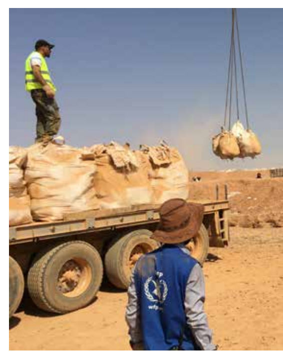
UN agencies deliver relief to Syrians stranded at Syria-Jordan border, August 2016.

Only a small minority of Berm residents can cross into Jordan, either for emergency treatment or for settlement in the Azraq refugee camp some 300km away. On average only three Berm families per week are allowed through the Bustana or Ruwayshid Transit Centres for settlement in Jordan. And, citing security concerns, of these few allowed into Azraq, only a quarter are settled with the camp's general population; most are confined to Villages 2 and 5 where they have severely restricted access to the outside world