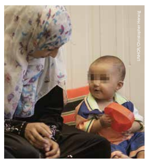
Now a refugee in Za'atari camp, this baby's mother has spent more than ten months securing a birth certificate for her young son (their family documents having been destroyed in a rocket attack on their house in Syria) in order to ensure he has a legal identity.

Lack of the documentation required to complete birth registration is a major problem, with many refugees having lost their documents or having had them destroyed or confiscated. (Marriage registration is particularly important since a marriage certificate is typically required for birth