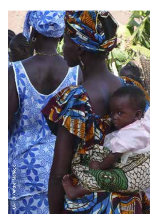
Senegalese refugees from Casamance wait for food distribution, in the Gambia

The host communities' own poverty and their dependence on subsistence farming, however, led non-governmental organisations (NGOs), in conjunction with UNHCR, to divide responsibility for the provision of aid for the refugees and the host communities at the time, although some provision – such as wells and communal