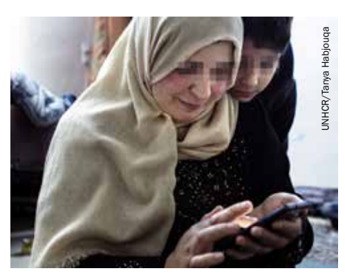
A Syrian refugee is showing her son text messages from his father who left months before for Europe, leaving his 15-year-old son as the only breadwinner at home. The children send photos and their father responds with advice for studies – and lullabies for the youngest

individuals to make informed decisions and prepare adequately for the time it takes to reunite