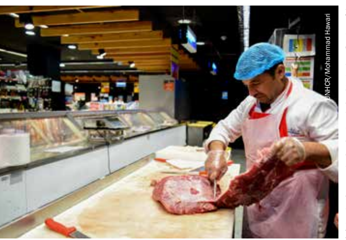
This Syrian refugee works as a butcher in Amman, Jordan, having been granted a work permit by the government.

However, building on the 3RP and the London Conference commitments, there is now a stronger shared vision for humanitarian assistance,