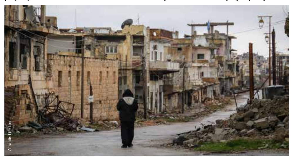
Damaged Al Arbeen neighbourhood, Dara'a city centre, 2017.

The future return of IDPs and refugees to their communities of origin inside Syria is likely to result in a very high number of competing claims over the use and occupancy of land and property by original owners, secondary occupants and illegal occupants. Throughout the course of the conflict property transactions have continued to take place, often as private contracts or agreements between individuals that are not recorded in statutory systems. Many owners have sold property due to financial pressures. In addition, there have been forced evictions, expropriation and property transactions made under duress. Secondary occupation and land and property disputes