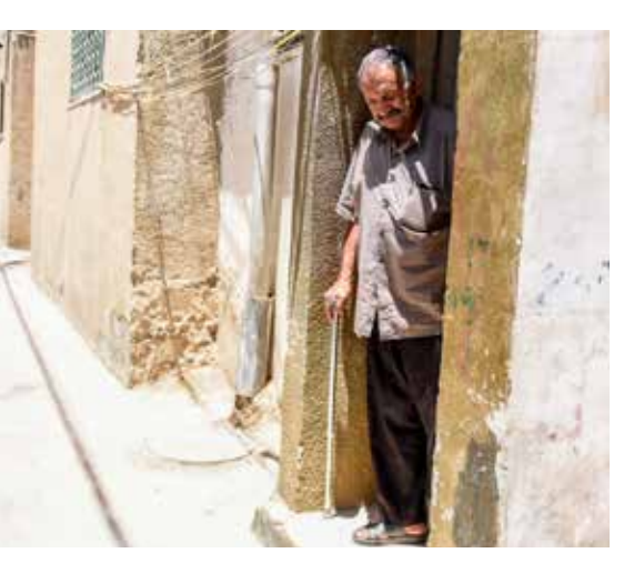
65-year-old Syrian refugee living in Jordan with his wife; both have disabilities.