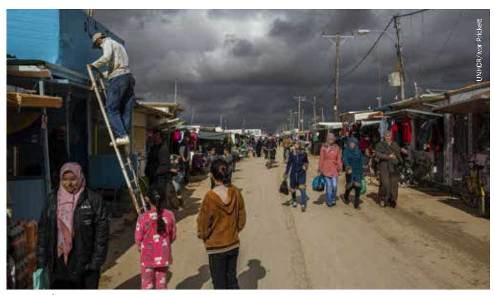
The 'Shams-Élysées', Za'atari refugee camp.

to the resilience of its entrepreneurial camp dwellers. But the camp's humanitarian governance also played a key role in this, as public spaces for refugees were allowed to form on an impromptu basis using facilities provided by non-governmental organisations (NGOs) such as schools, bread distribution centres and medical clinics. When the first arrivals took advantage of regular foot traffic along the camp's main road to open up independent shops, creating what is known as the Shams Élysées (playing on the name of the Avenue des Champs Élysées, a prestigious street in Paris, with Sham meaning Syria in Arabic), UNHCR, the UN Refugee Agency, did not shut it down but rather negotiated with shopkeepers to regulate its size and electricity usage. In fact, NGOs make constant concessions to allow a degree of camp development that can be regulated for the sake of security but that allows